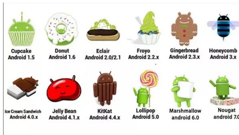
Figure 1. Of Android Versions