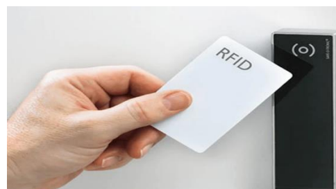
Figure 3. The RFID tag is in working mode