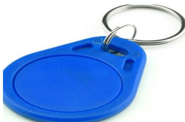
Figure 2. RFID tag