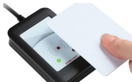
Figure 5. RFID reader in working mode