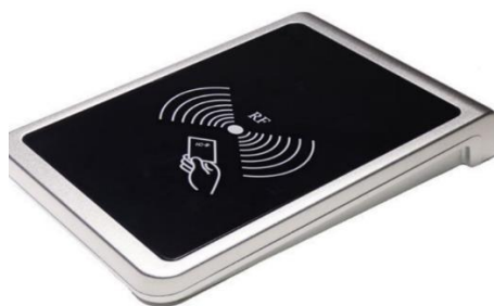
Figure 4. RFID reader