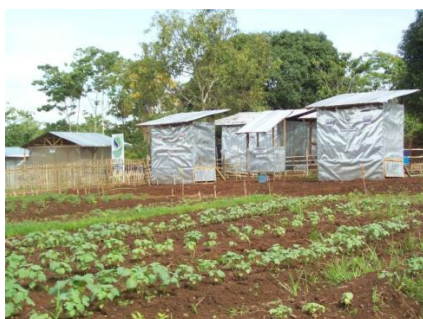
Figure 3. Facilities of the TPS System With Reuse of Urine in Vegetable Crops (Factura et al., 2014)

Sanitation technologies have been developed to provide methods and techniques for the separate collection, treatment and reuse of human excreta (Otterpohl et al., 2002). Ecological sanitation (ecosan) is a cycle - a sustainable, closed-loop system, which closes the gap between sanitation and agriculture by recycling the nutrients contained in human excreta in crop production (Langergraber & Muellegger, 2004). Terra Preta Sanitation (TPS) converts faecal matter through vermicomposting into hygienic organic matter that can be used to fertilize soil (Factura et al., 2010). TPS system (Figure 3) was successfully implemented in Xavier Ecoville, a resettlement community with 500 survivor families after typhoon Washi devastated Cagayan de Oro City, Philippines in 2011 (Factura et al., 2014). The World Health Organization (2006) published treatment guidelines that renders safe reuse of excreta in agriculture. A community urine diversion dehydration toilet (UDDT) as shown in Figure 4 has been widely implemented by various organizations especially in tropical countries of Asia and Africa (EcoSan Club, 2010; Gensch et al., 2010). Urine and faeces are separately collected and treated. Urine is stored in closed plastic container for at least 1 month before reuse.