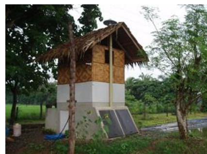
Figure 4. UDDT of the Periurban Vegetable Project in Manresa Farm, Xavier University-Ateneo de Cagayan, Cagayan de Oro City, Philippines